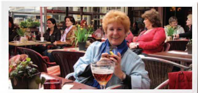
Sample beer at a local restaurant