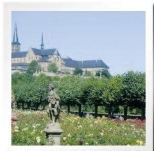
St. Michael’s Church, Bamberg