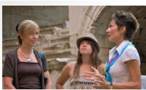
Tour famous sites